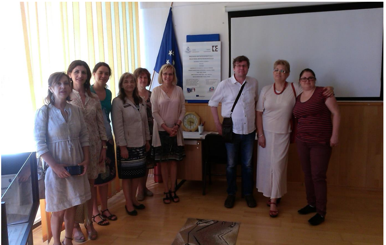
Second meeting of the partners in Onesti, Romania, June 2015

All partners presented their researches/analyses about unemployment and entrepreneurship approaches, as well as best practices of entrepreneurship teaching in their countries. We worked on the finalization of the three teaching modules and discussed further details of the Trainer Workshop in Iceland. We were also introduced to the methods practiced in Romania. We established the next steps to be taken in the project, and we allocated further tasks to be accomplished.